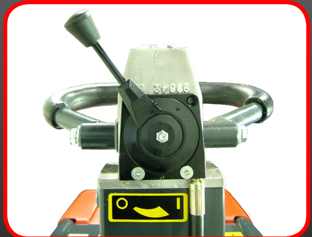
Hydraulic Gear Shift