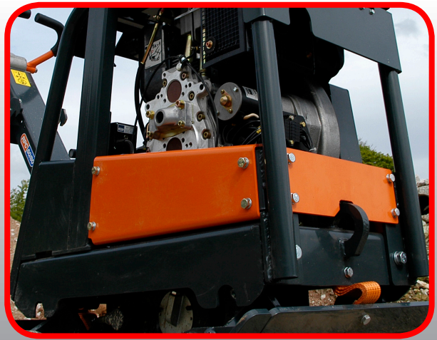
Removable Covers for Easy Maintenance