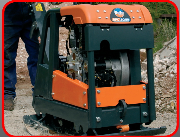
Robust Frame for Tough Site conditions & Built-In Lifting Points